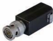
DS-1H18 Video Balun