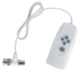
PFM820 UTC Controller