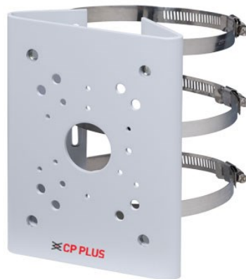
CP-UA-B3P Pole Mount Bracket