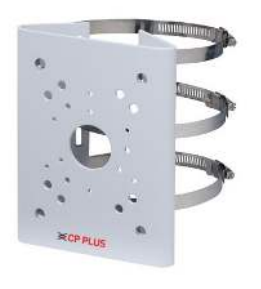
CP-UA-B3P Pole Mount